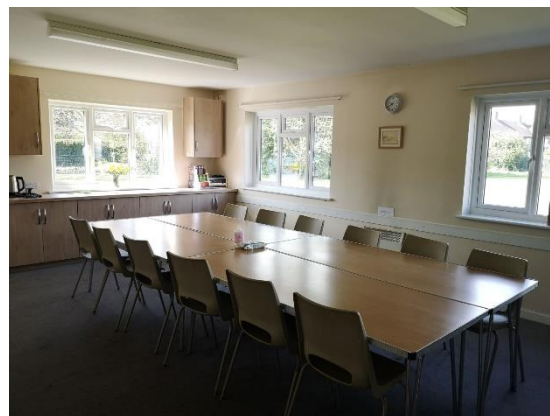
The upgraded Meeting Room in the Parish Hall